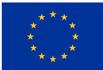
With the support of the Erasmus+ programme of the European Union

In addition, a disclaimer must be added to the inner pages of any communications or publications relating to Erasmus+ funded projects to indicate that the material reflects only the author's views and that the European Commission and UK NA are not responsible for any use that may be made of the information it contains.